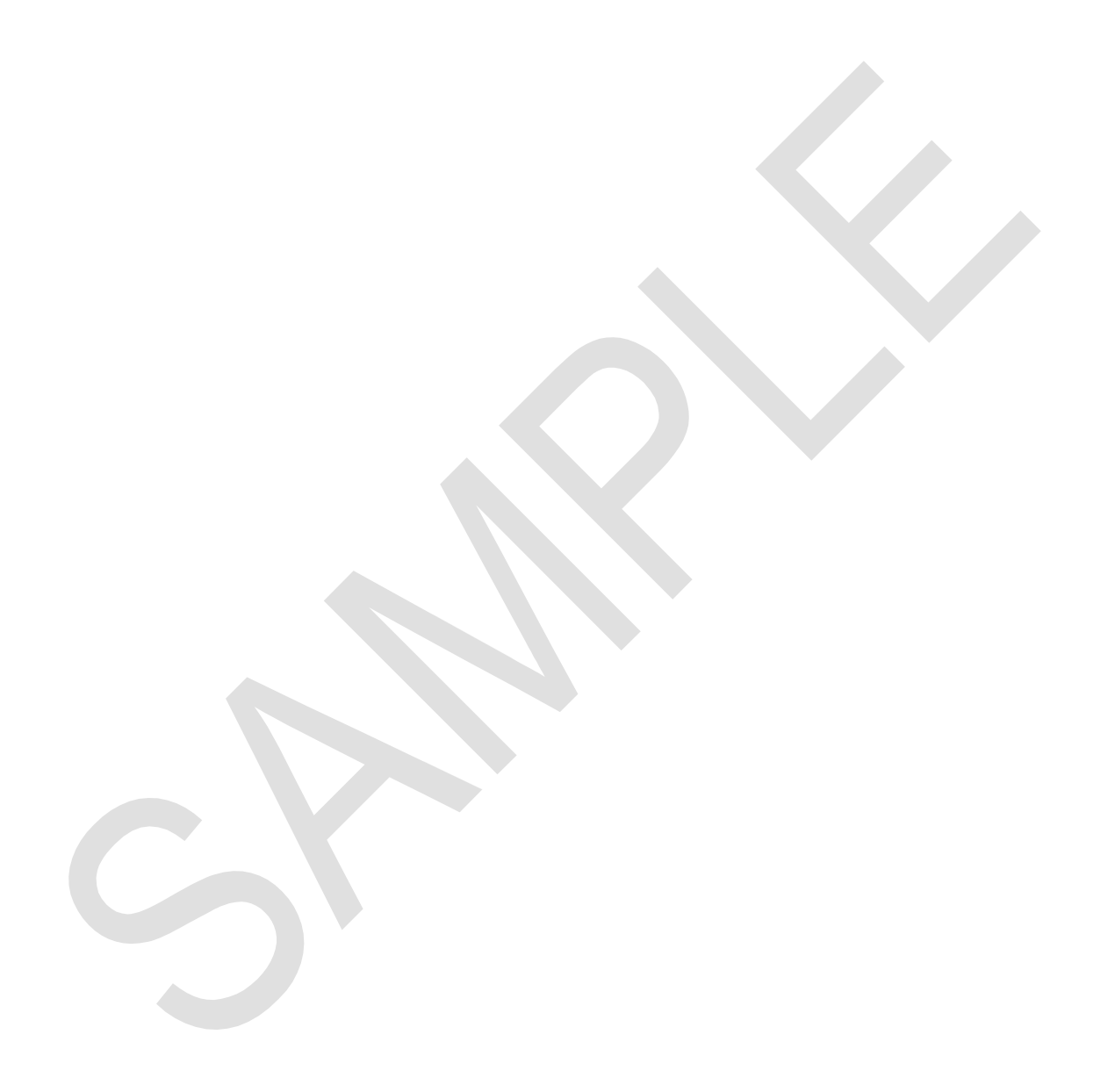
\underline{\textbf{Exhibit E}} Consent and Subordination by Lienholder